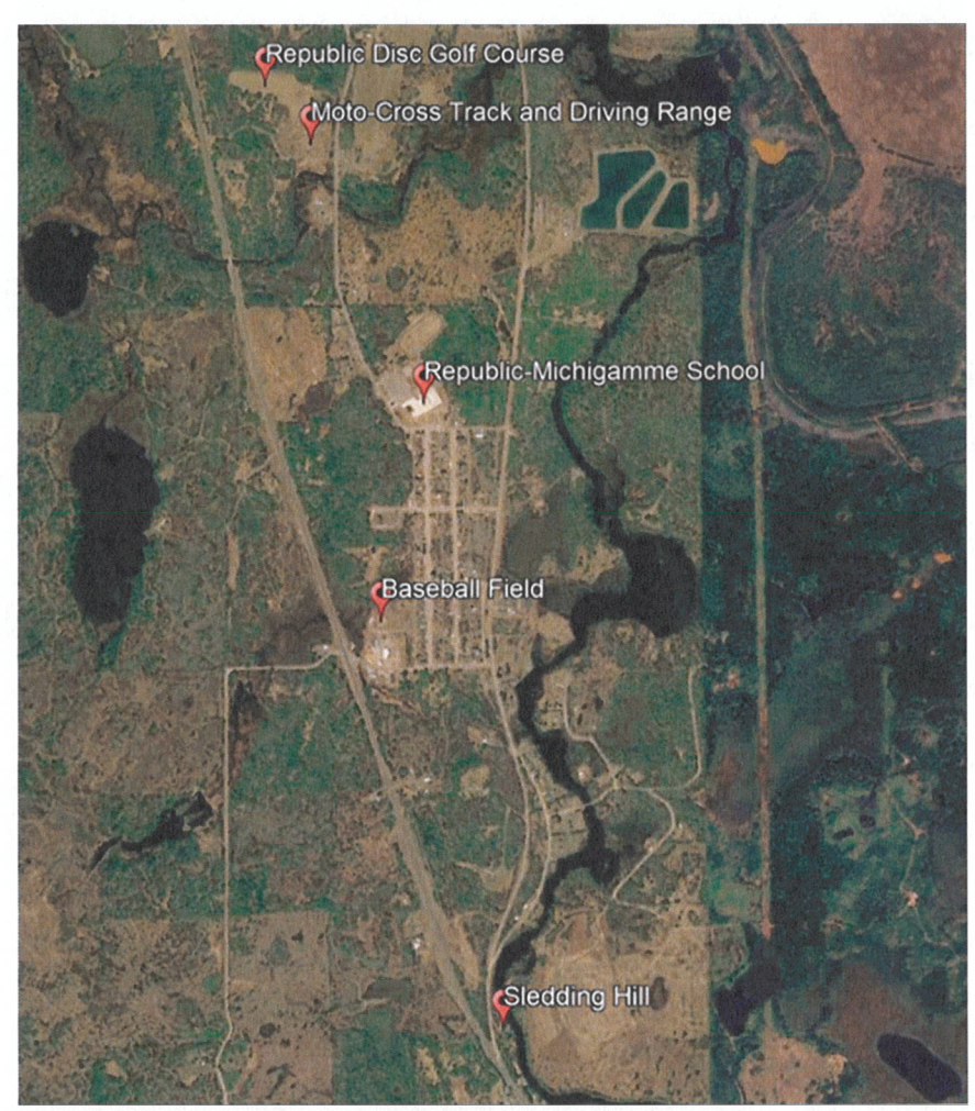
Appendix I Township Board & Planning Commission Recreation Committee Chair