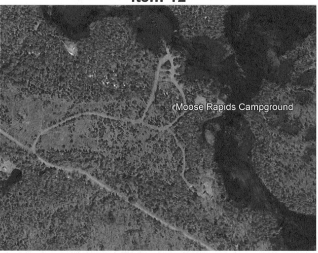
South Republic Items:1-5